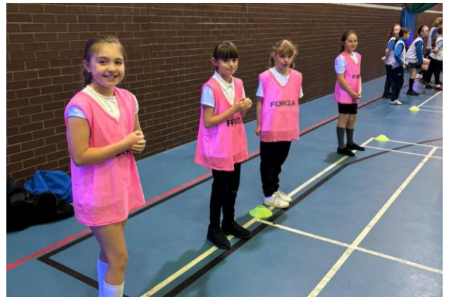
East Lancashire "This Girl Can" multi-sports event at Roefield Leisure Centre, Clitheroe

Congratulations to the latest groups of children who have represented St Joseph's at the recent Rossendale Schools Sports Partnership competitions. As always, you did us proud!