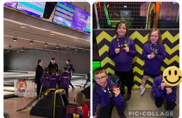
Panathlon Ten Pin Bowling at Disco Bowl, Burnley

God wants me to be the best me I can be.