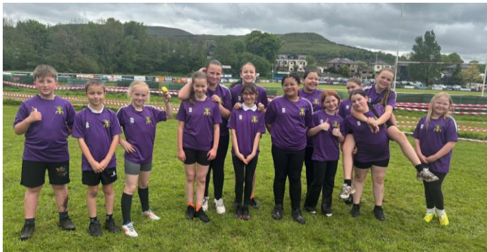
Year 5&6 Cross Country

Congratulations to the latest group of children who have represented St Joseph's at the recent Rossendale Schools Sports Partnership competitions. As always, you did us proud!