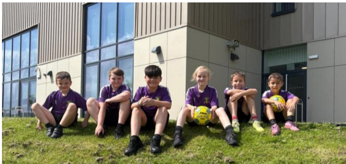
Key Stage 2 Footgolf