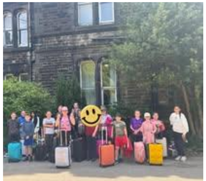
Year 6 Residential took place at Robinwood in Todmorden