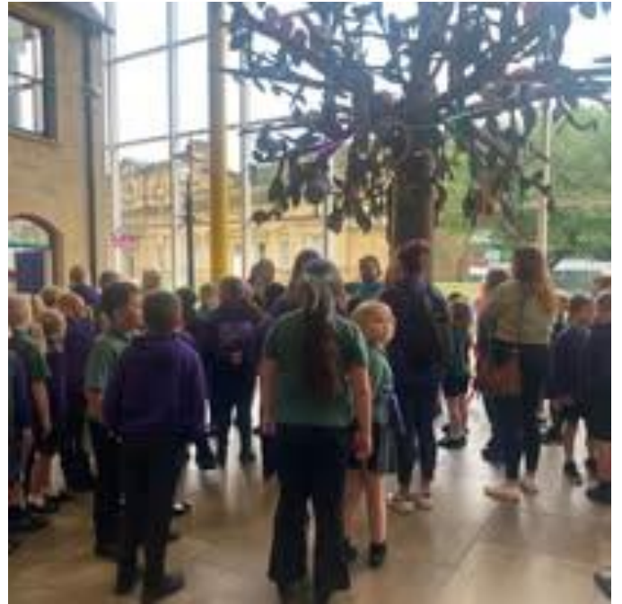
Penguins Class and Robins Class visited the Eureka National Children's Museum in Halifax