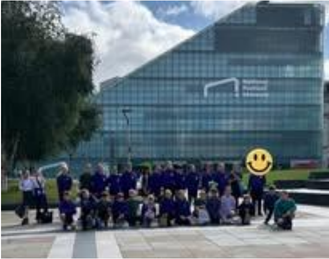
Eagles Class visited the National Football Museum in Manchester.