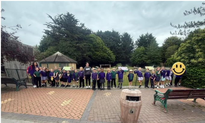
Flamingoes Class visited Blackpool Zoo