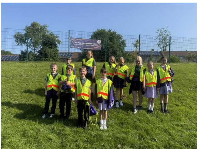
Year 5 went tubing at Ski Rossendale

God wants me to be the best me I can be.